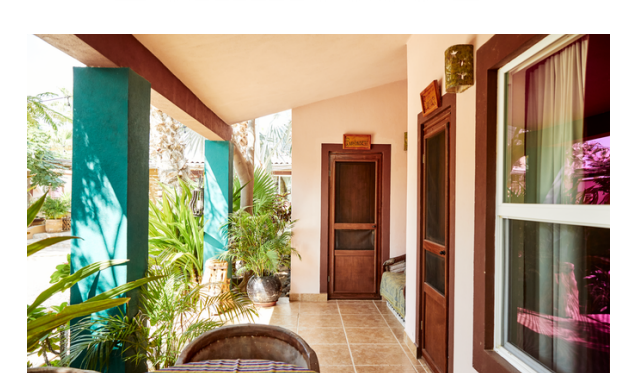
2 Queen Beds 1-4 people