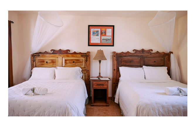
2 Queen Beds, 1-4 people