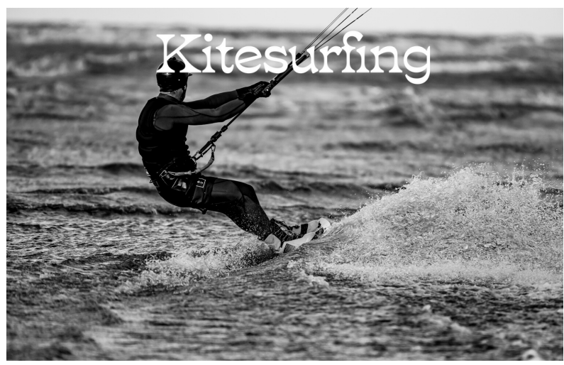
When the surf is flat, kitesurfers take advantage of the regular offshore winds with world-class conditions in the big ocean playground that is Scorpion Bay. With a sand bottom and plenty of options for wind and swell directions, you'll always have a wave to ride (with or without a kite).