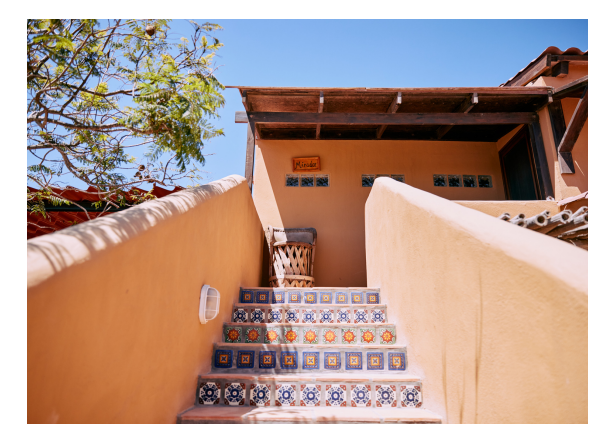
1 king bed, 1 single bed 1-3 people