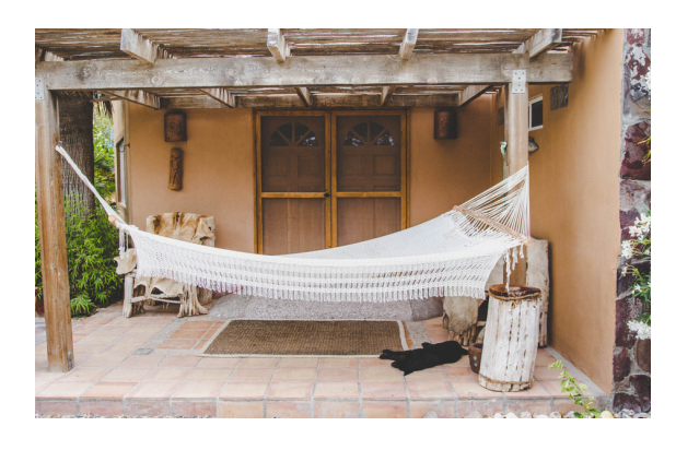
Private room with 1 queen bed, private room with 1 king bed & private room with 2 single beds and 2 bathrooms