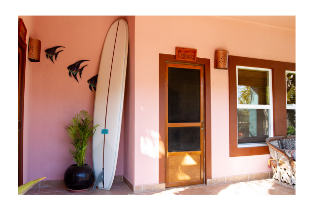
1 king bed, 1-2 people